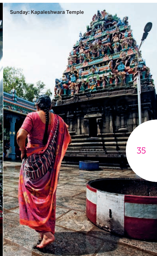
Sunday: Kapaleshwara Temple