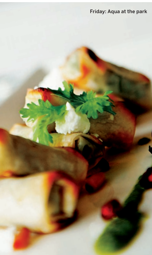
Friday: Aqua at the park