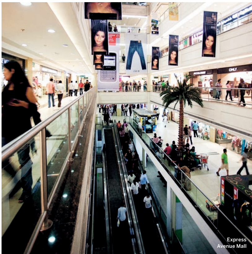
Express Avenue Mall

restaurants. The popular buffet features a variety of fabulous dishes, with different daily offerings from a wide range of cuisines: Lebanese, Italian, and North and South Indian. Start your gourmet tour at the chaat counter, move to the antipasti bar and then head to the vegetarian or non-veg counters featuring delicious mains. The Indian and continental desserts are simply superb.