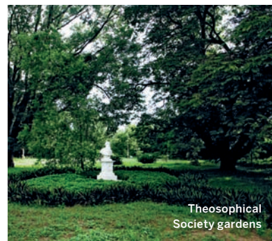
Theosophical Society gardens

* Rice is the staple of the lunchtime meal. This is eaten with a variety of vegetable dishes, like poriyal (vegetables mixed with coconut and curry leaves), and rice preparations, including tomato rice, coconut rice and lemon rice. Plain rice is then eaten with sambhar , followed by rasam (a thin soup made with tomato and tamarind) and then curd (yogurt) to complete the meal. These lunchtime meals are often served on traditional banana leaves in restaurants and at weddings. In South India, sweets are generally eaten at the beginning of the meal, not at the end!