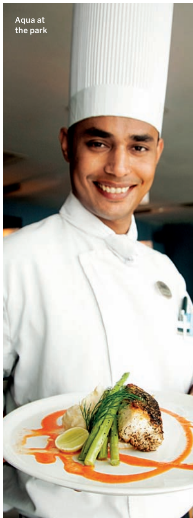
Aqua at the park

11PM Once the bars close, Chennai's night owls head to one of the many 24-hour restaurants located at the city's five-star hotels. Make up for the calories you lost on the dance floor at Anise in the Taj Coromandel Hotel, where you'll find a variety of appetising Indian and continental dishes. From masala dosa to Caesar salad to nasi goreng , there's something to satisfy just about any craving.